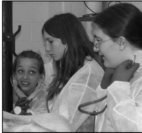
Boiler Vet Camp participants

■ The Department of Foods and Nutrition has two studies: mini-Camp Calcium in the spring semester for girls ages 10-12 and Build Better Bones for