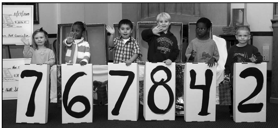
Children from Tippecanoe County Child Care reveal the total for the 2009 Purdue United Way Campaign at a celebration event on Nov. 17 in Purdue Memorial Union.